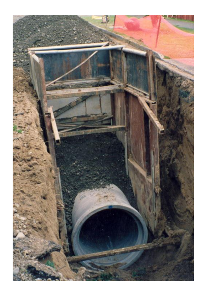
Trench excavation with steel shoring

The trenches are then backfilled, compacted and signage attached. Signage gives information about the services positions, depth of installation and provider contact details.