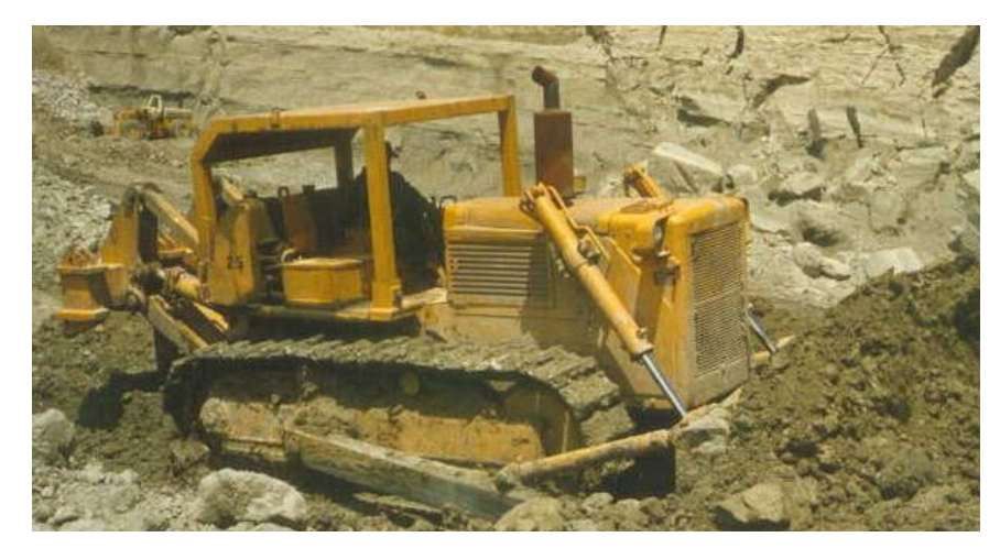
Bulldozers are used in site clearing and bulk earthworks

This involves clearing and levelling the site so that the work can be carried out.