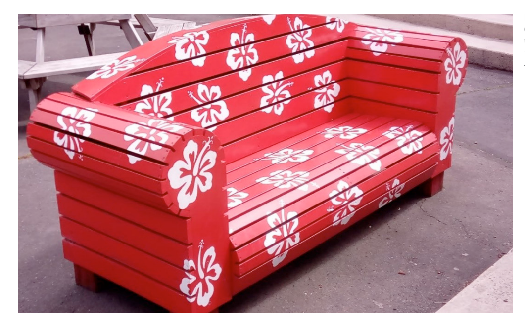
Painted wooden sofa (matching chair not shown) - Taieri College.