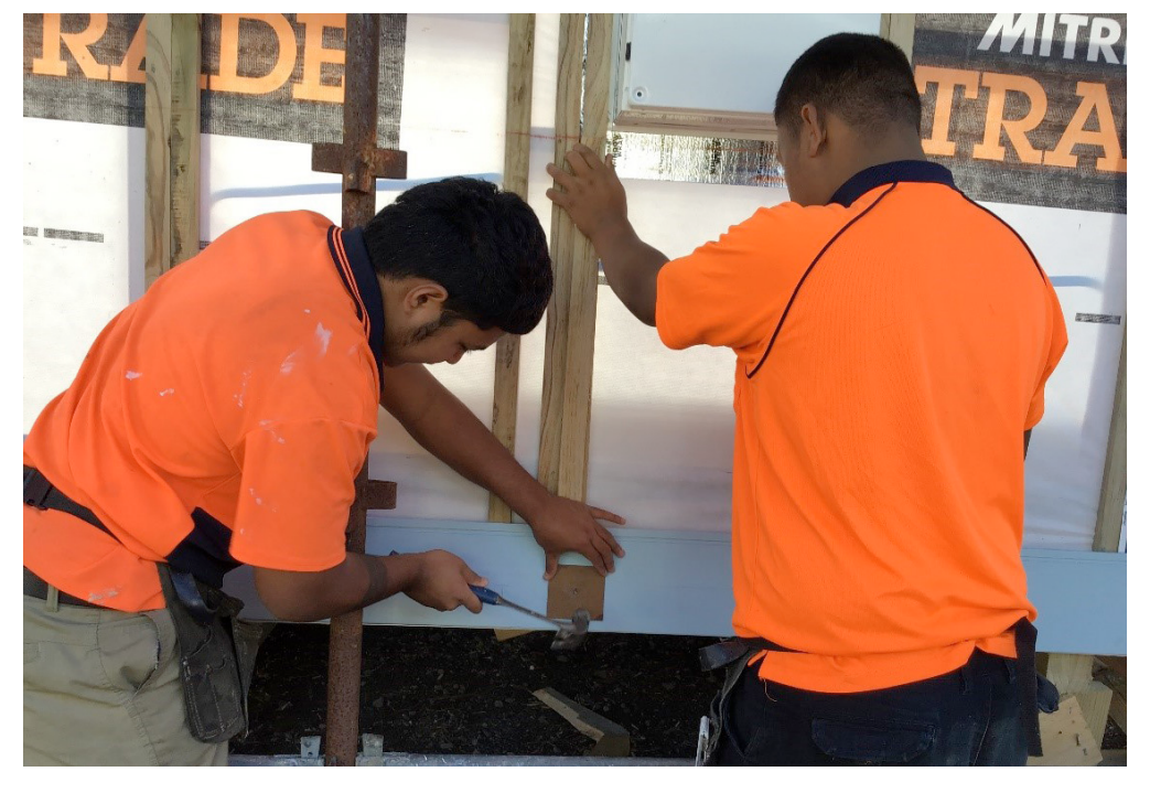
Students at Bay of Islands College constructing a house.