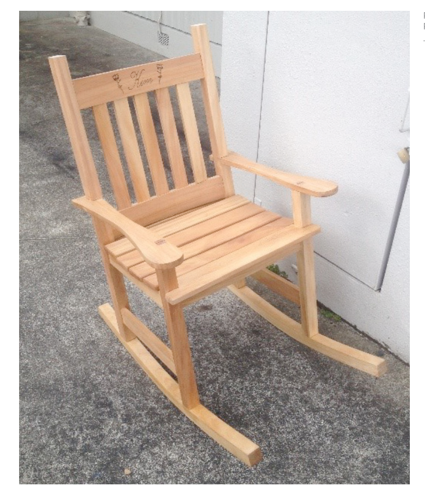
Rocking Chair – Rutherford College

Photographic and observational evidence must include proof that the projects' materials have been cut/measured/calculated/applied as required for the Stage 3 BCATS project.