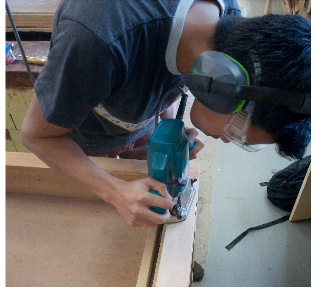
Hagley Community College.