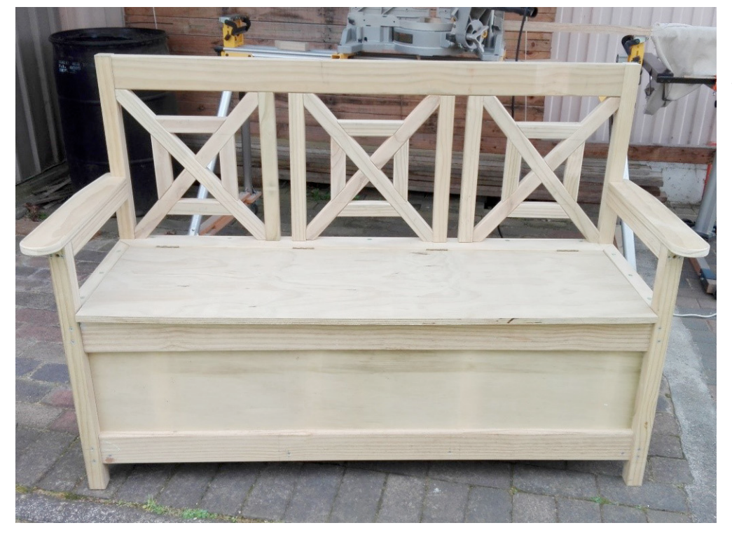
Bench seat with storage - Te Aho o Te Kura Pounamu (The Correspondence School).